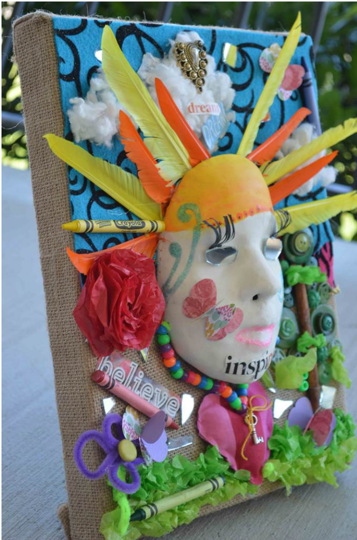
2013-2014 Reflections Student Artwork, UT