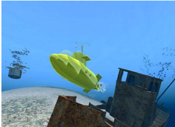
Computer Generated Image by Wikipedia

Computer Generated Image = image created from scratch using computer software.